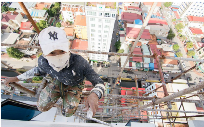
A painter painting a highrise building in Phnom Penh without any security gear.